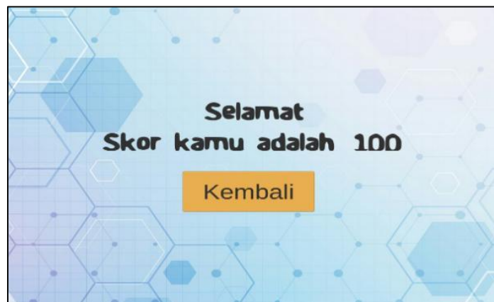
Figure 3. Last Score Page Show