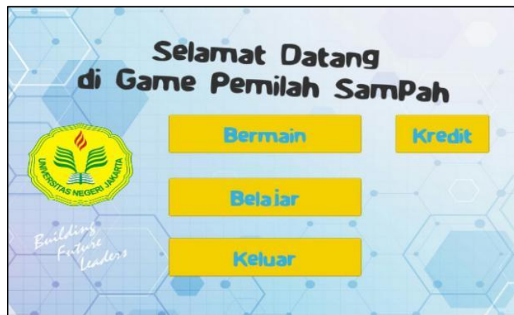
Figure 1. Game Main Page