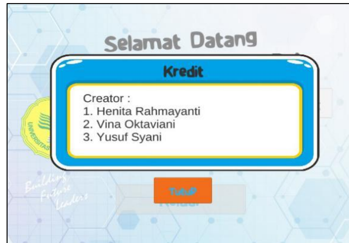
Figure 5. Development Team Display

calculation result has 100% percentage. This percentage shows that every software in sorting waste of this game is running well.