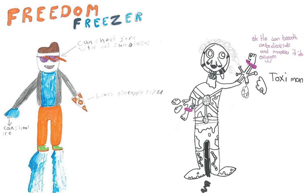
FIGURE 2 Freedom Freezer and Toxi man characters.