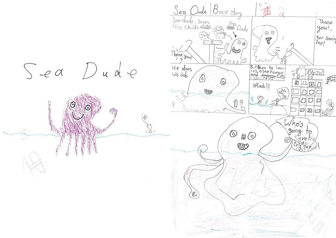
FIGURE 1 Sea Dude character and story extract.