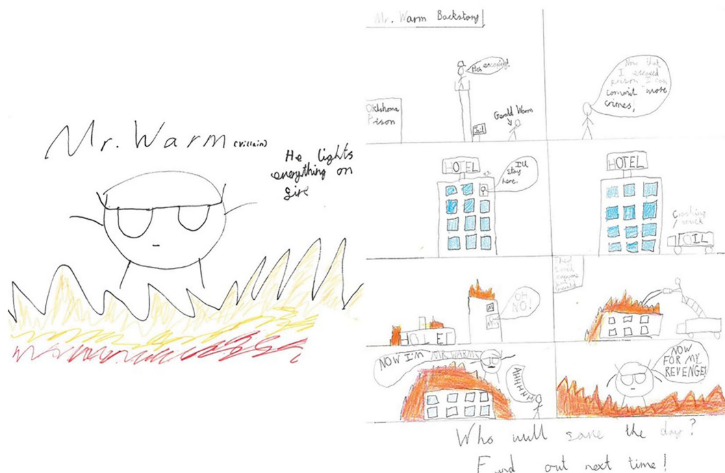
FIGURE 3 Supervillain Mr Warm and story extract.

different global contexts. We are awaiting the results of the Fijian children's superhero inventions, which will provide interesting comparisons.